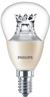
LEDluster MAS SLR1 P48 E14 CL