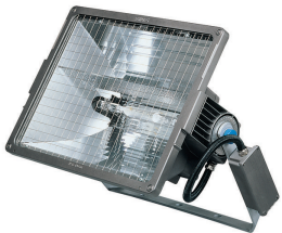
PowerVision MVF024 sports and area flood lighting luminaire