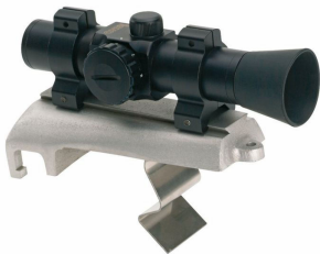
Zařízení pro přesné zaměření