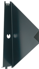
Simple aiming device