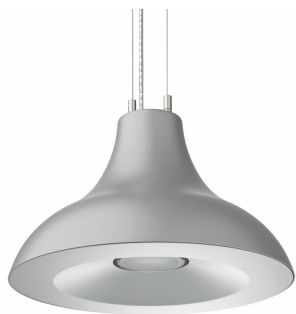
FreshFood pendant PT570P luminaire