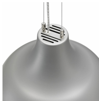
FreshFood pendant – top view