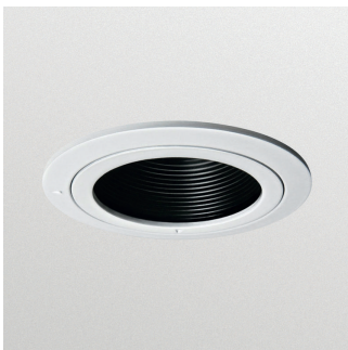
QBS047 1x MAX50W WH