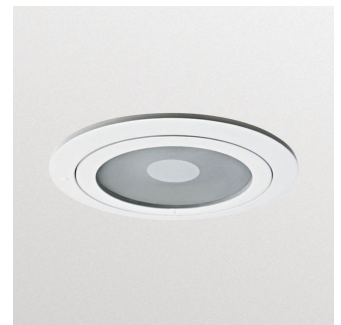
QBS048 1x MAX50W WH