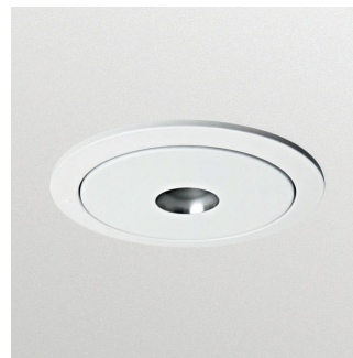
QBS042 1x MAX50W WH