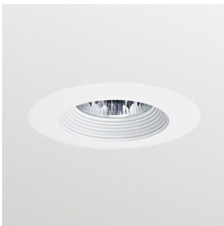
QBS020 1x MAX35W WH