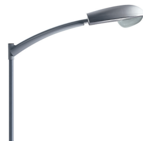
Single bracket (ZRS250 MBS)