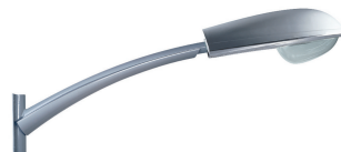
Wall mounting bracket (ZRS250 MBW)

"Opti-O", where the reflector is attached to the canopy. This facilitates maintenance because it provides easy access.