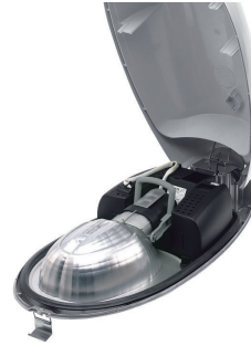
"Opti-C", where the reflector forms one unit with the bowl, and the lamp holder is attached to the reflector.