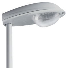
Iridium SGS252/452 road-lighting luminaire with polycarbonate bowl (PC)