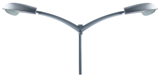
Double bracket (ZRS250 MBT)