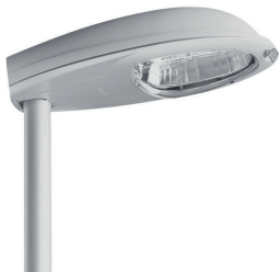
Iridium SGS253/453 road-lighting luminaire with flat glass (FG) or flat glass with DynaClean coating (FGD)