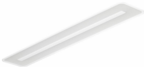
IPPR SM480Ci 0001