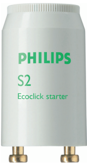
LPPR STARTER PHL 0004