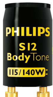
LPPR1 STARTER S12