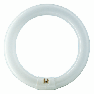
LPPR TL-E8 G10q