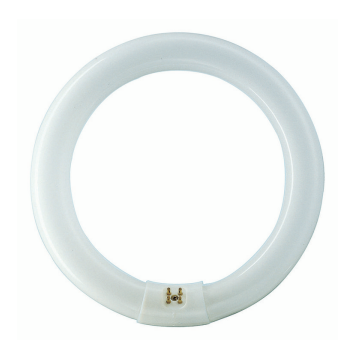
LPPR TL-ESTD G10q