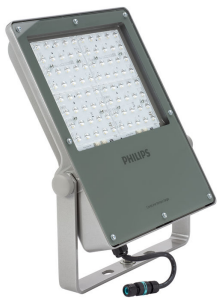
Coreline tempo large-BVP130