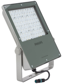
Coreline tempo large BVP130 flood-lighting luminaire