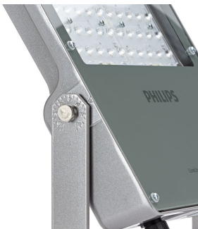
Graduated aiming scale