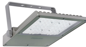
Horizontal mounting position