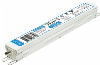
CENTIUM ELE BALLAST (2) F32T8 120-277V