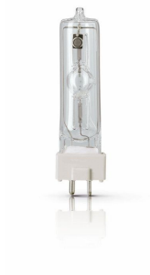
MSD 200(/2), MSD 250(/2)