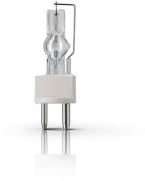
MSR 1200 SA, MSR 2000 SA