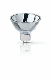
XPPR XHOPDI 0002