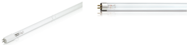
4 pins single ended