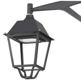
Villa LED BSP765 pedestrian luminaire, suspended version