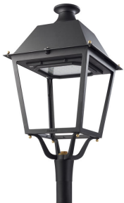
Villa LED BDP765 pedestrian luminaire, post-top version