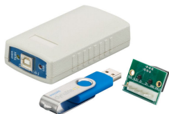
DTK622 Network Gateway