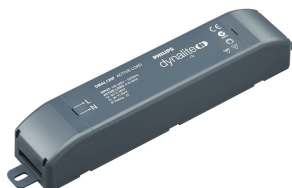
DMAL120F Active Load