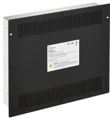
DH2x24, DIN Rail Enclosure