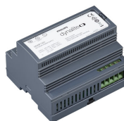
DDNP1501 Product shot