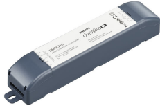
DMRC210 2 x 10A Relay Controller