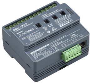
DDRC420FR 4 x 20A Relay Controller