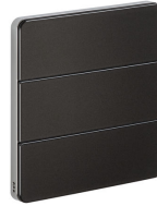
PABPE AntumbraButton EU