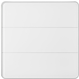
PATPE AntumbraTouch EU White - Front