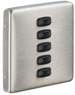
DLPE Standard Series User Interfaces