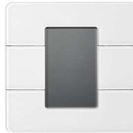
PADPE AntumbraDisplay EU White - Front