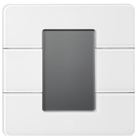
PADPE AntumbraDisplay EU White - Front