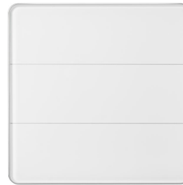
PATPE AntumbraTouch EU White - Front