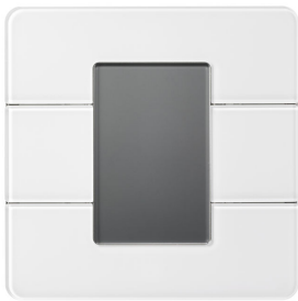
PADPE AntumbraDisplay EU White - Front