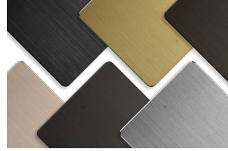
AntumbraButton - Different colors Button Finish