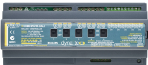
DDBC516FR 5 x 16A Signal Dimmer Controller front