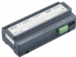
DDBC1200 Signal Dimmer Controller