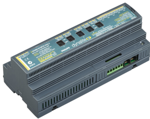
DDBC516FR 5 x 16A Signal Dimmer Controller