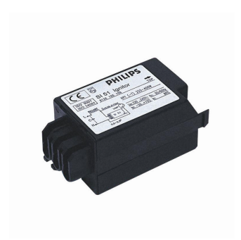
SN 58 T5