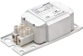
BPL 018 X262