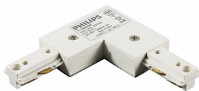
Basic Track ZCS170 Ordercode 911400894680, 911400894880