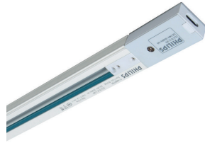
Basic Track RCS170