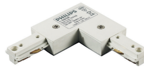
Basic Track ZCS170