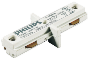
Basic Track ZCS170 Ordercode 911400894380, 911400894580