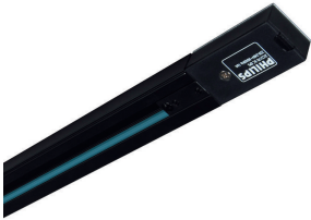
Basic Track RCS170