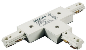
Basic Track ZCS170 Ordercode 911400894980, 911400895180