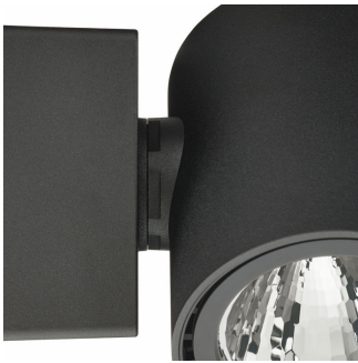
Customized hinge for re-aiming from the ground with a pole