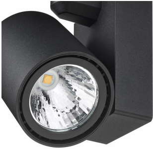
Detailed front face for an optimized light effect