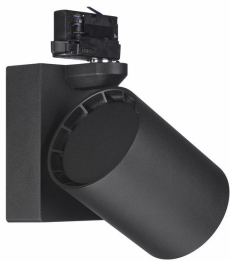
Fully integrated heatsink