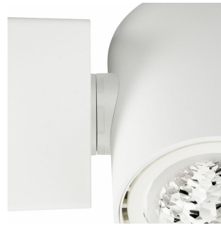
Customized hinge for re-aiming from the ground with a pole