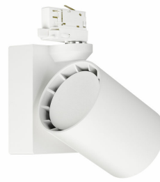
Fully integrated heatsink