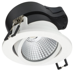
ClearAccent RS061B recessed spotlight, adjustable version