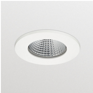
ClearAccent RS060B recessed spotlight, fixed version