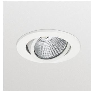
ClearAccent RS061B recessed spotlight, adjustable version