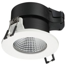
ClearAccent RS060B recessed spotlight, fixed version