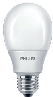
5 W, 8 W, 11 W E27 Erp