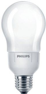
12W, 16W E27 A65 Erp