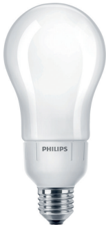
23W E27 A75 Erp