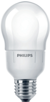
9W E27 A60C Erp