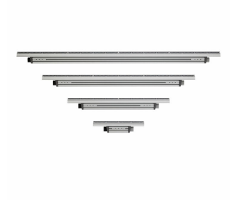
Graze Powercore, Input Connection