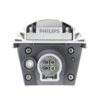
Graze Powercore, 305 mm (1 ft)