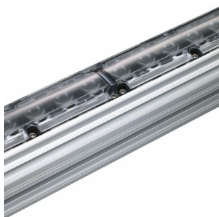
ColorGrazе MX Powercore 4ft ALT 2 Detail Shot