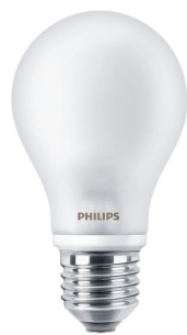
LED Lamps, LEDclassic A60 E27 WW FR