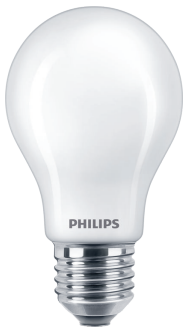
Bulb A67 100W 1521lm 2700K E27 NDFrosted