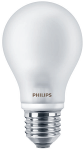
E27 A60 Frosted