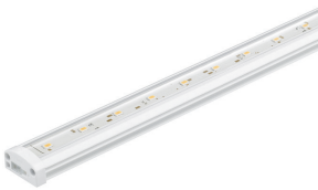
Vaya Cove SM440L batten