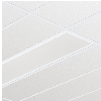
SlimBlend recessed mod. 600