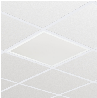
SlimBlend recessed mod. 600