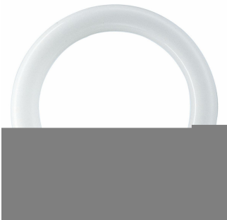
LPPR TL-ESTDJ G10q C-T9