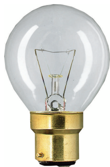
LPPR ILUSBSTD B22 P45 CL