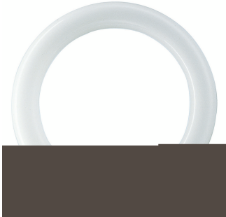
LPPR TL-ESTD G10q