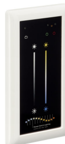
PowerBalance Tunable White, recessed DP