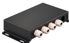
PowerBalance Tunable White, recessed DP