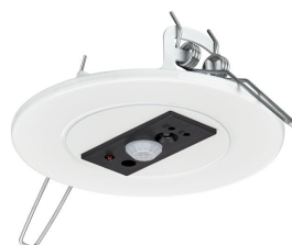
PowerBalance Tunable White, recessed DP