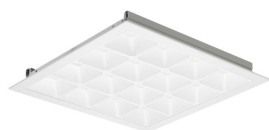
PowerBalance Tunable White, recessed RC464B W60L60 DP