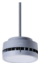
GreenUp Lowbay G2 BY288P