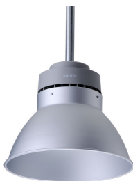
GreenUp Lowbay G2 BY288P w Reflector