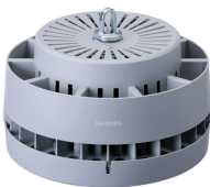
GreenUp Lowbay G2 BY288P Back