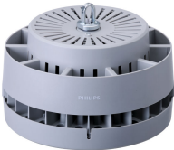
GreenUp Lowbay G2 BY288P Back