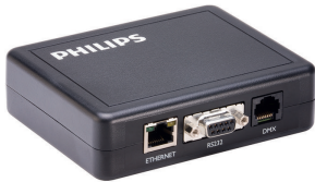
Multi-protocol converter Ordercode 88463699