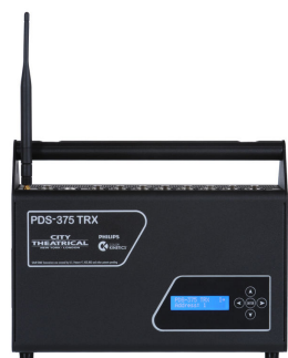
PWRDAT PDS-375 TRX