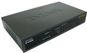
Unmanaged switch 4 POE port, 48 V Ordercode 37658399