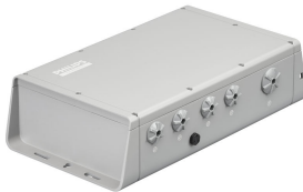
PDS-400 48V EO Ordercode 39221799