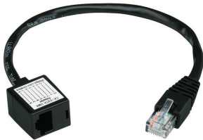
DMX crossover cable, CK to Esta Ordercode 70342599