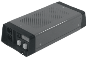
sPDS-60ca 24V Ordercode 910503700106