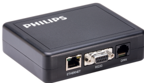
Multi-protocol converter Ordercode 910503701414