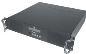
sPDS-480CA Ordercode 910503700107