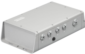
PDS-400 48V EO Ordercode 912400133799