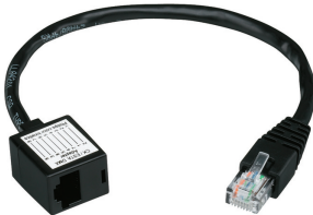
DMX crossover cable, CK to Esta Ordercode 910503700737