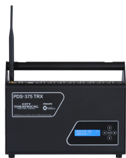
PWRDAT PDS-375 TRX