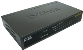
Unmanaged switch 4 POE port, 48 V Ordercode 910503702557