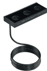
LCU7590 3 Phase Coil