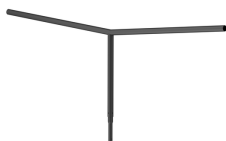
KC DA-JGM001 S1500