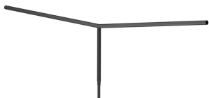
KC DA-JGM001 S2000