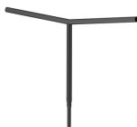
KC DA-JGM001 S1000