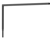
KC SA Bracket-JGM001 S2000