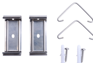
WT066C Mounting Bracket Detail Photo