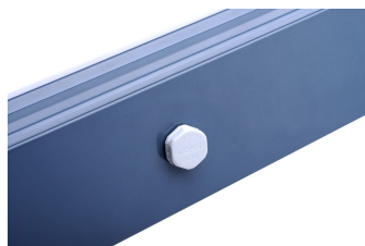
WT066C Breather Detail Photo