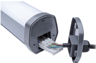
WT188C Terminal Block Pushin Detail Photo